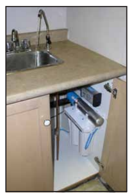
Typical Installation for drinking water under the sink